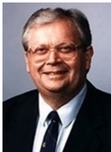
David Lange Former Prime Minister

"Many of the arguments against binding referenda are demeaning. They assume people always vote for things which are popular, which carry benefits without acknowledging the costs. These arguments have been largely discredited by the experience overseas."