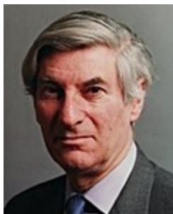
Professor Vernon Bogdanor

"In the last resort, the arguments against the referendum are also arguments against democracy, while acceptance of the referendum is but the logical consequence of accepting the democratic form of government."